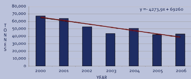
Figure 2: Cocoa production profile of 19 farms in Noling and Tampumea

Ghana, on the other hand, is progressing rapidly. It had lagged behind, with a very low 'average' of around 250-300 kg/ha in the mid-1990s. This was due, in part, to an ageing and almost abandoned cocoa tree stock, planted below a dense canopy. Ghanaian cocoa production is now above 400 kg/ha, with some regions above 500 kg/ha. It should keep